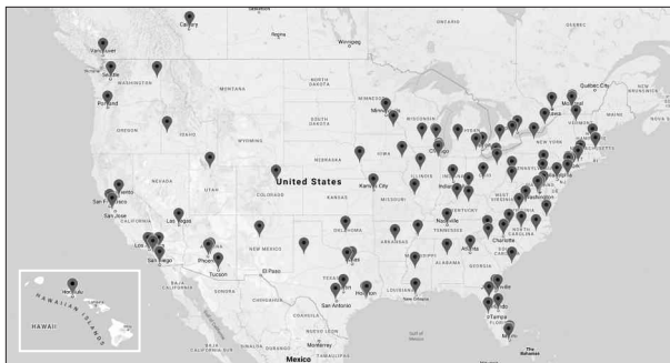
The online directory's interactive map of North American ACHD programs.